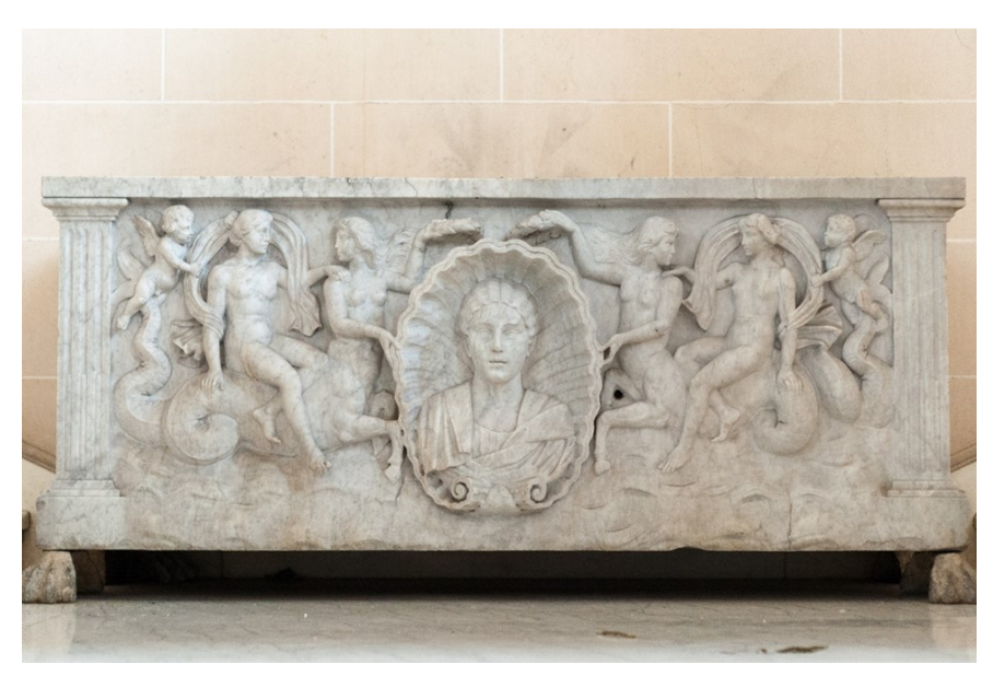
The beautifully cleaned and polished finished product!

It is our sincerest hope that you will have an opportunity to visit our Headquarters to enjoy its grandeur and beauty and that you will be a part of the ongoing preservation, restoration and conservation efforts to preserve it for future generations of the Eastern Star.