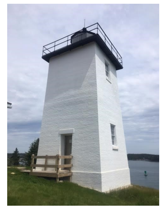
Hockamock Head Lighthouse