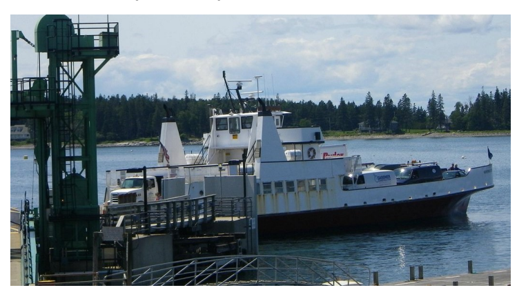
Ferry to Swan's Island